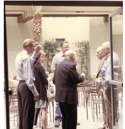
Members socialize before the meeting