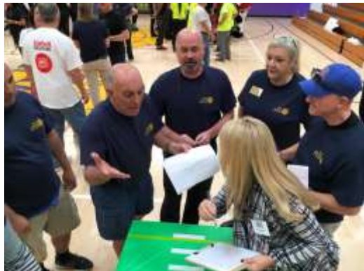
Chick-Fill-A chicken joins the action